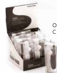
OPTICAL CARE KIT