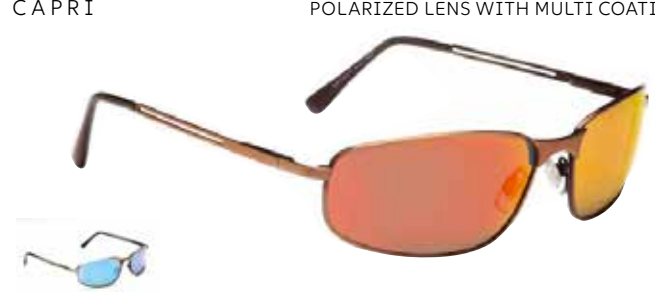
POLARIZED LENS WITH MULTI COATING