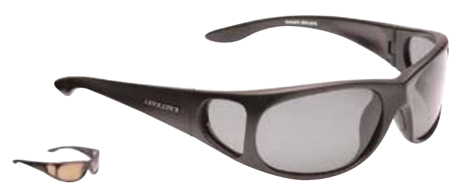
GLARE BLOCKING SIDE SHIELDS