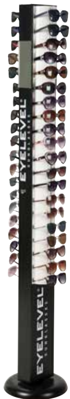
EYELEVEL FLOOR 40