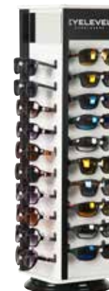
EYELEVEL COUNTER 40