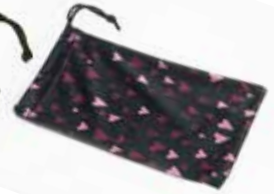
HEART PRINTED POUCH