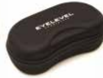
ZIP CASE MEDIUM