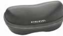
ZIP CASE LARGE