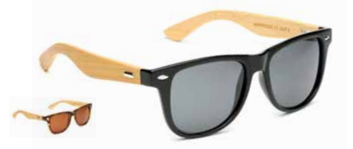
HARRISON WITH BAMBOO TEMPLES