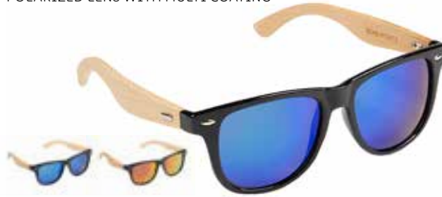
ECHO POLARIZED LENS WITH MULTI COATING WITH BAMBOO TEMPLES