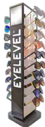
EYELEVEL COUNTER 20